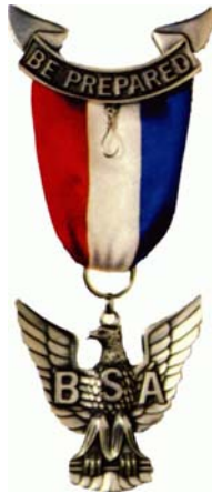
Medal awarded to Boy Scouts who have achieved the Eagle Boy Scout Rank.

CONGRATULATIONS On this outstanding achievement!!